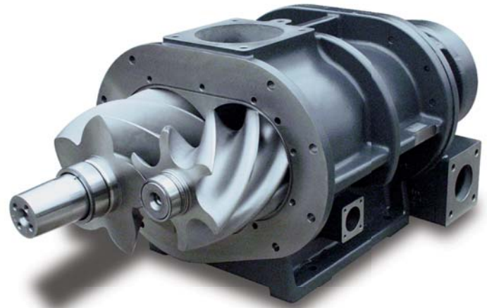
FIGURE 4: Rotary screw compressors have a higher initial purchase price, but can be a long term cost effective solution.

FIGURE 3: CAGI data sheets publish compressor performance information and are verified by third party testing. Manufacturers publish these data sheets on their website. For more information, visit www.cagi.org .