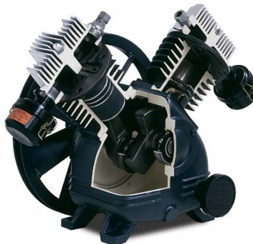
FIGURE 3: Although routine maintenance for piston compressors is inexpensive, they have much higher oil carry-over and have higher operating temperatures.

20 degree (F) increase in temperature doubles air's ability to hold moisture.